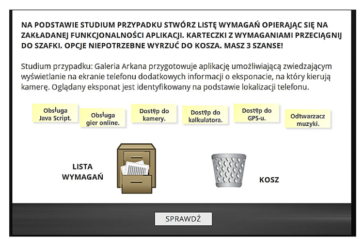
Fig. 2. Example of "Drag and Drop" type of interaction [4]